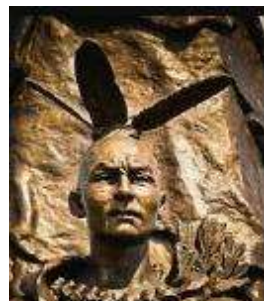
Lenape Chief Tamanend, 1682