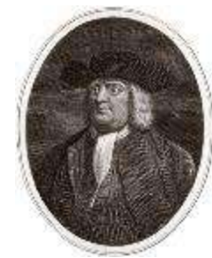
Settler William Penn, 1682

We accept .pdf format with medium compression. Color should be CMYK and not RGB.